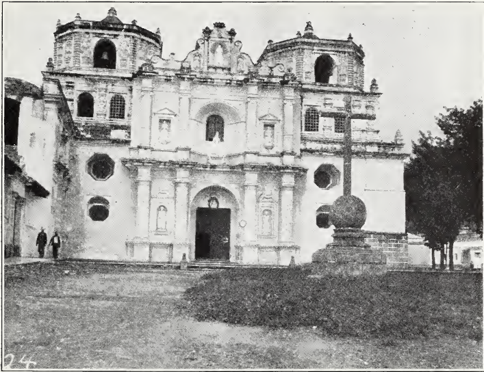
La Merced Church, Antigua, Guatemala.